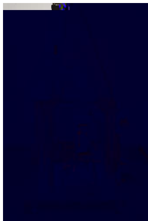
自研数字光投影机